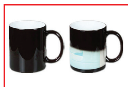
MAGIC COATED MUG