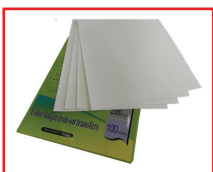
HEAT TRANSFER PAPER

Model : ROYALTECH RT8IN1 Temperature Range : 0 – 399 °C Time Range : 0 – 60 S T-Shirt Press : One Plate Press : Two Mug Press : Four Cap Press : One Weight : 40kg