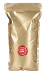
DTF HOT MELT POWDER