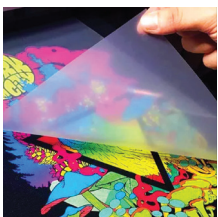
DTF SAMPLE 1

Model : ROYALTECH RTDTF330 Printer Head : Epson Max. Printing Size : 330 x 600 (mm) Print Resolution : 5760 x 2880 (DPI) Color : CMYK + WW Powder Shaker Width : 330mm Powder Shaker Speed : Adjustable Powder Shaker Volume : Adjustable Dimensions (LxDxH) : 460 x 610 x 750 (mm) Printer / 900 x 550 x 500 (mm) Powder Shaker Weight : 16kg (Printer) / 30kg (Powder Shaker)