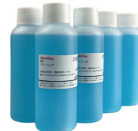
UV DTF CLEANING LIQUID Weight : 1kg/bottle