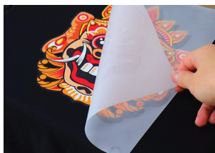
DTF SAMPLE 2