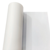
DTF HOT ROLL FILM