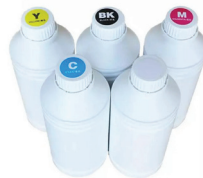
UV DTF INK CMYK CMYK : 4kg/Set (C-1kg, M-1kg, Y-1kg, K-1kg) WHITE : 1kg/bottle VARNISH : 1kg/bottle