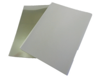
EXPOSURE FILM & PARCHMENT PAPER

FLASH STAMP MACHINE (AUTO FLASH) Model : ROYALTECH RTAFS36A Max. Output Power : 3600J Max. Charging Time : 30 sec Exposure Voltage Range : 360 – 400 V Exposure Range : 50 x 80 (mm) Exposure Lamp Quantity : 3 (Straight) Exposure Lamp Length : 13cm Power Supply : 220V / 50Hz Dimensions (LxDxH) : 360 x 145 x 210 (mm) Weight : 8kg