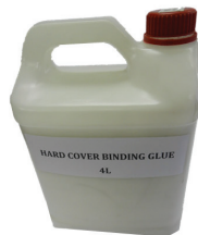
HARD COVER BINDING GLUE - 4L